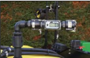
Sprayers fitted with a fast flow water intake, such as the John Deere HD200 SelectSpray, may also have the option of specifying an electronic flow meter with auto shut off.