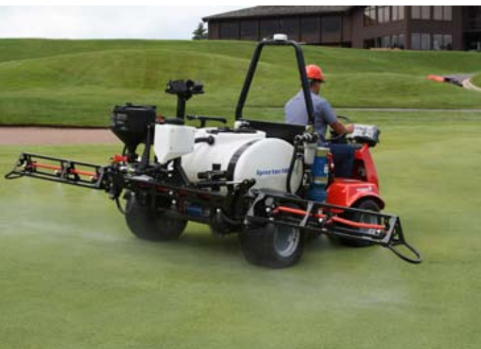
Spray Star sprayers from Ransomes Jacobsen are purpose built self-propelled units. Where a demount sprayer combination will be used full-time as a sprayer, it may be worth looking at a dedicated unit as an alternative.