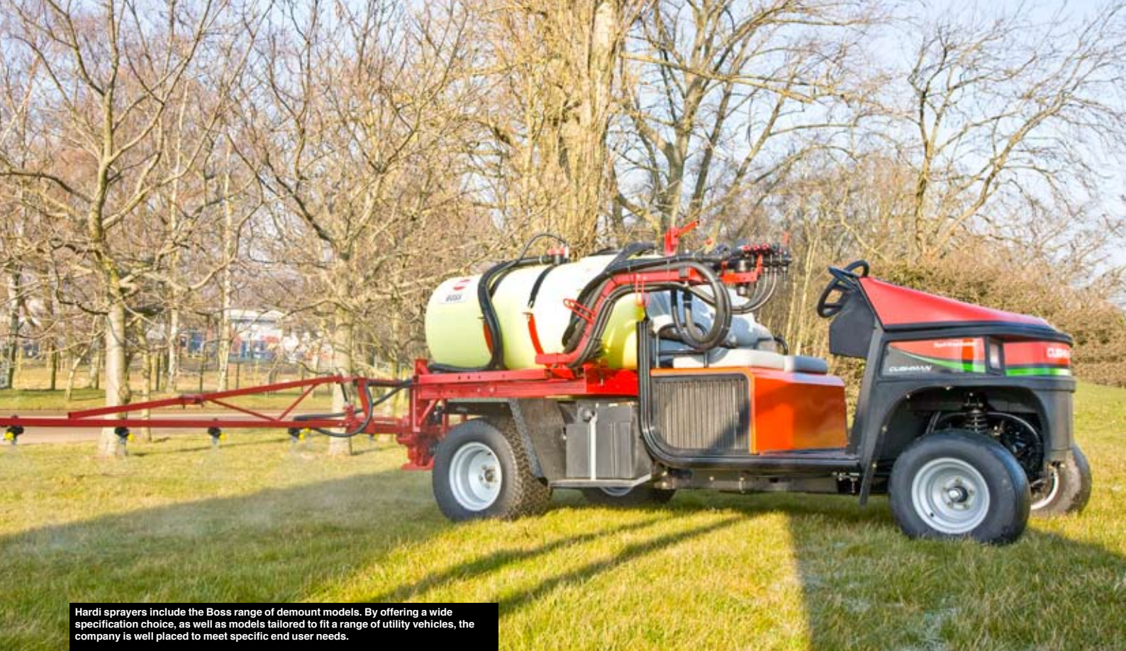
Hardi sprayers include the Boss range of demount models. By offering a wide specification choice, as well as models tailored to fit a range of utility vehicles, the company is well placed to meet specific end user needs.