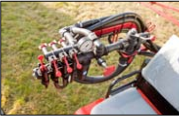
Basic mechanical controls, with boom section shut-off and pressure gauge, are simple to understand and well suited to applications such as applying liquid feeds.