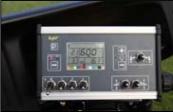
More advanced electronic controllers make precision spraying more straightforward. The key is to work out what is needed and how receptive the operator is to using this type of system.