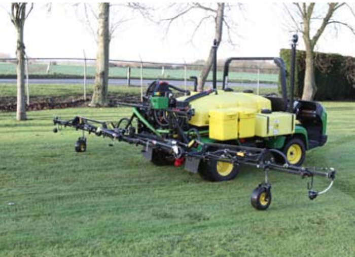
A low profile, combined with a high standard specification, can make a complete demount sprayer package an attractive buy. John Deere Select Spray and ProGator combinations are increasingly purchased together.