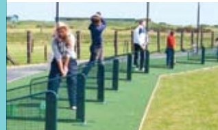
Huxley Practice Tee at St Andrews Links

Top quality practice tees, golf course tees, putting & pitching greens, pathways, patios, cart tracks and lawns professionally designed and installed.