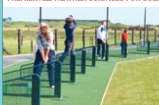
Huxley Practice Tee at St Andrews Links

Huxley Golf PREMIER ALL-WEATHER SURFACES FOR GOLF