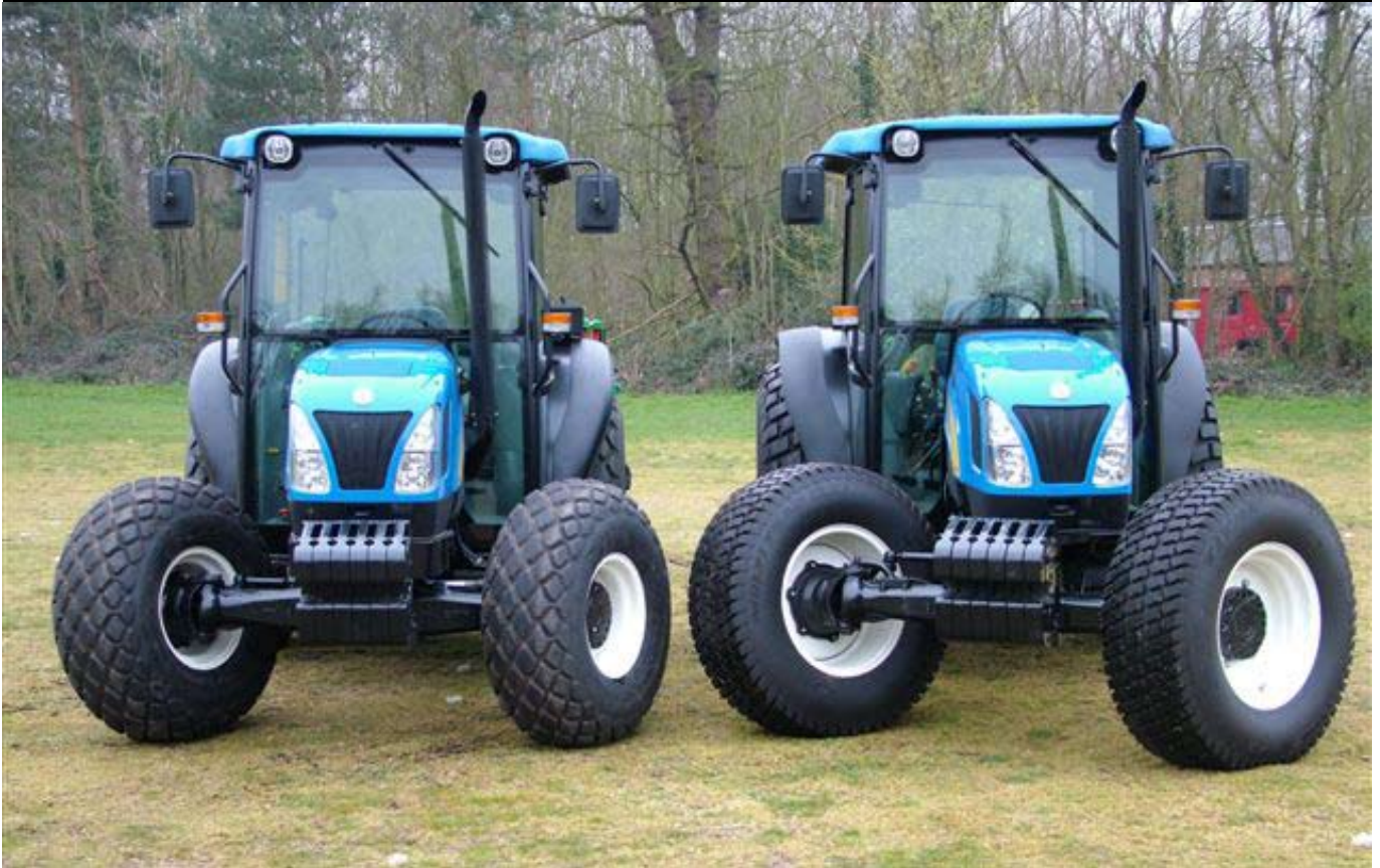
SuperSteer on the right has a pronounced effect on the agility of the tractor but the front tyres retain relatively flat contact with the ground, even at full lock.