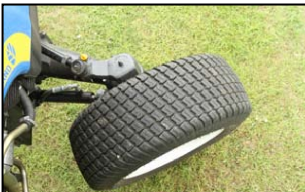
Viewed at full lock from above, note how the front wheel remains 'flat' at full lock. This is claimed by New Holland to help SuperSteer deliver a clean turn on fine turf.

At the tail end of 1997, New Holland launched the TNF orchard tractor series in the UK. Offered in power variants of a nominal 65, 75 and 95hp, the TNF series could well have slipped by unnoticed.