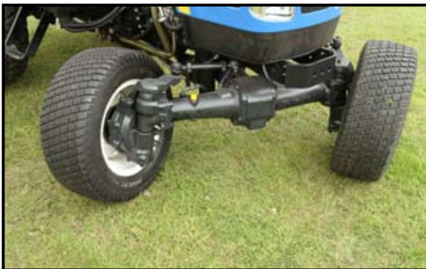
Pictured on a lower powered Boomer compact tractor, SuperSteer is now a widely available feature on New Holland tractors. Note axle movement across the front of the tractor.