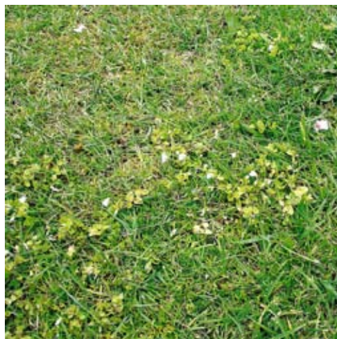
Dandelion (top right) is not a dedicated turf weed like slender speedwell (centre)