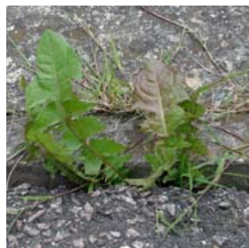
A dandelion between 'a rock and a hard place'

This article comes to you courtesy of the BIGGA L&D Fund. Thank you to our key sponsors