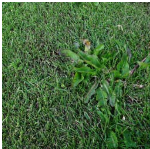
Prostrate dandelion biotypes lay flat on fine turf so that the growing point, leaves and sometimes even the flowers escape the mower's blades

Mention of any herbicide active is not a recommendation for its use. Users and operators should read the product label and if in doubt ask the supplier and/or manufacturer.