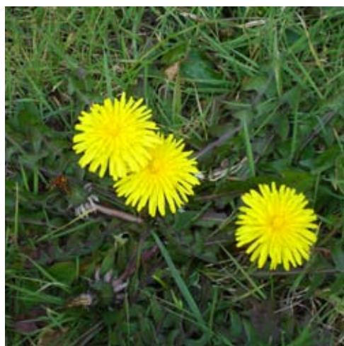
Turf can quickly go from 'grass green' to 'dandelion yellow' in April