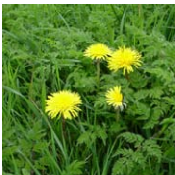
This year has seen a flush of dandelions especially in uncut amenity swards