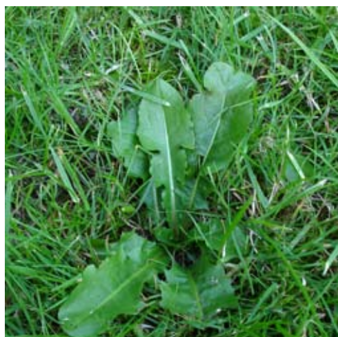
Dandelion is an opportunistic turf weed, its seeds exploiting gaps in the sward