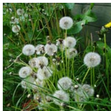
This is the fall out for greenkeepers from the dandelion explosion in the amenity sector