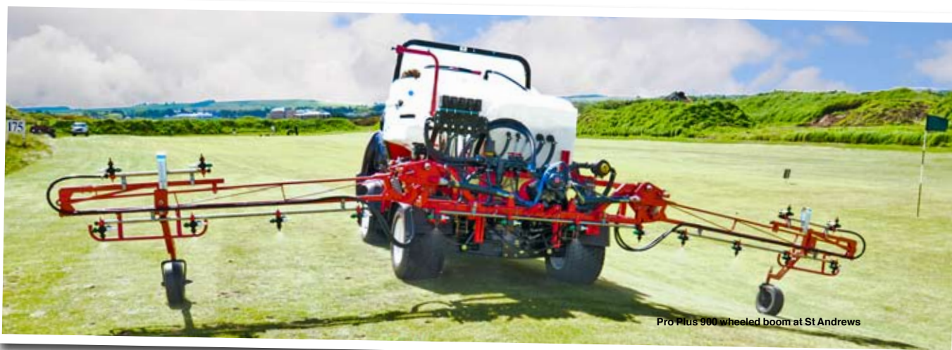
Pro Plus 900 wheeled boom at St Andrews