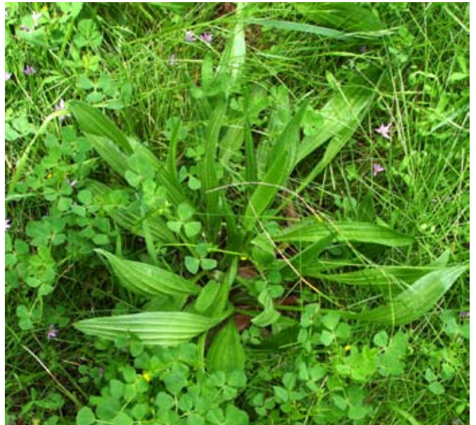
Lamb's tongue (ribwort plantain) and trifoliate burr medic