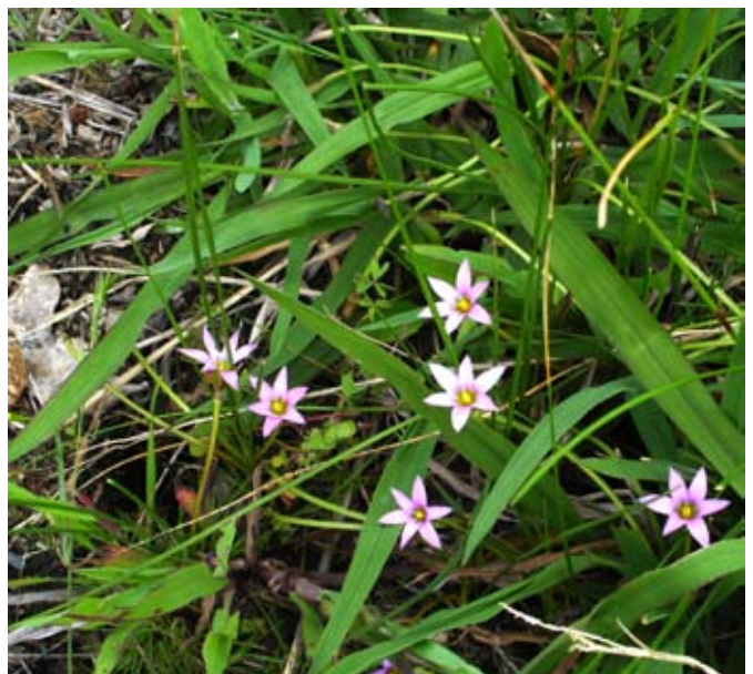
The leaves of onion grass blend in well but its pink