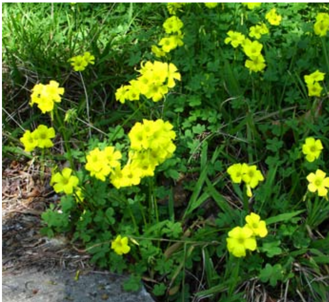
Soursob is one of the most difficult weeds to control