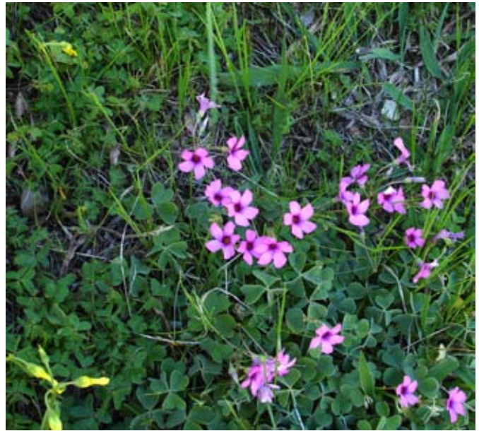
Purple flowered wood sorrel persists and spreads by corms