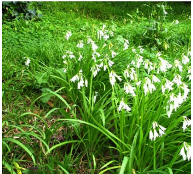
Three cornered garlic grows literally everywhere

Its stunning carmine-coloured flowers open in the sun and hardly make for a classic turf weed but this garden escape is still a plant in the wrong place at the wrong time and as such a weed of turf. It lacks the stolons of creeping oxalis but has underground stems (corms) presenting their own problems for weed persistence. Limited infestation can be removed by hand-digging because the corms are in a shallow situation just beneath the surface of the ground.