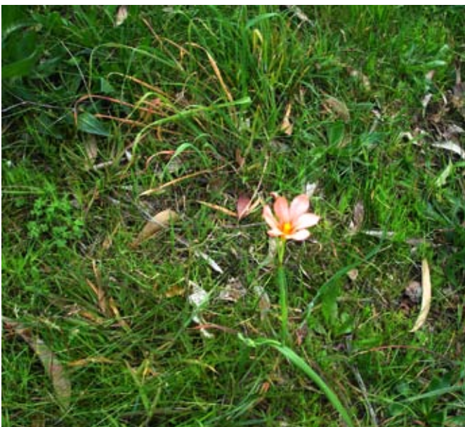
One leaved Cape Tulip, pretty as a picture but a weed nevertheless