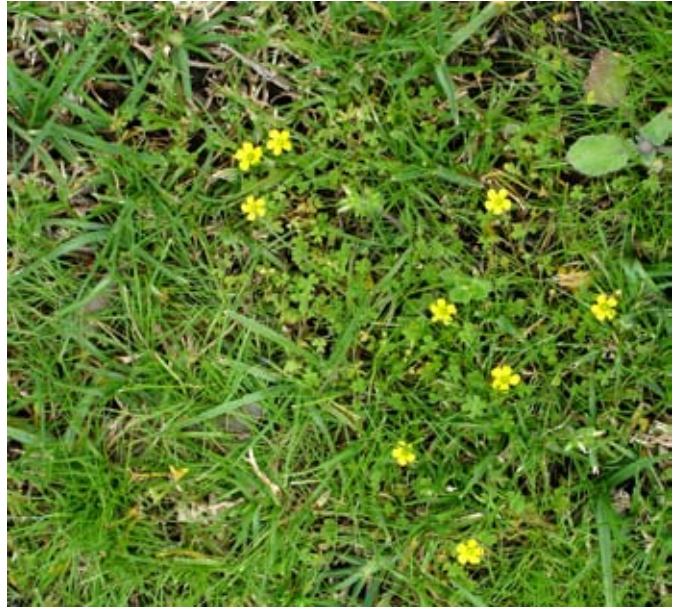
Creeping oxalis is a serious weed of close cut