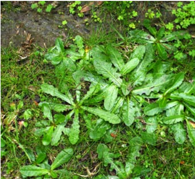
Flat weed (cat's ear) appears to be a bigger problem