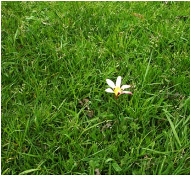
Plenty of Poa (winter grass) and a single 'shining'