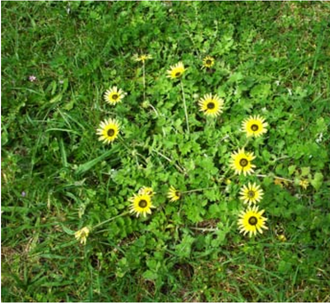
Cape dandelion is a classic rosette turf weed