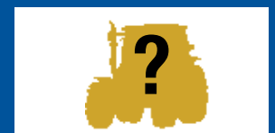
Gold Case IH Maxxum Tractor to be auctioned by sealed bid. Entries close 28 Feb 2010