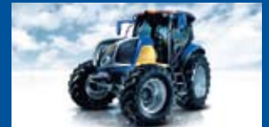
See the Ultra Eco-Friendly New Holland NH2 special hydrogen powered tractor