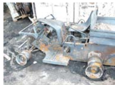
INSET ABOVE: Damage caused by the fire to a triple