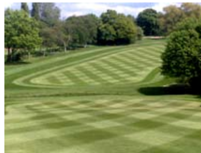
LEFT: Beautiful, diamond cut fairway on the 15th at Muswell Hill