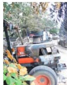
INSET ABOVE: Carnage caused by the fire, and a barely recognisable Kubota tractor.