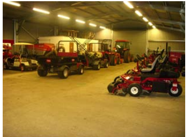
ABOVE: The new facility with its new fleet of Toro machinery