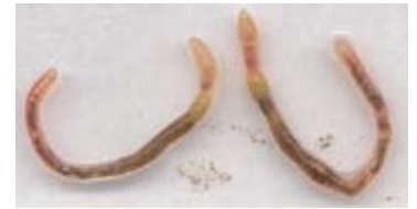
BELOW: Close-up of two adult specimens of Microscoclex phosphoreus . Each is of typical adult length, of about 25 mm long.