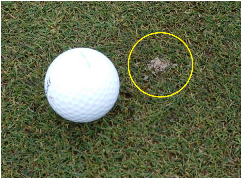
LEFT: A Microscoclex phosphoreus cast (circled) next to a golf ball to show size.