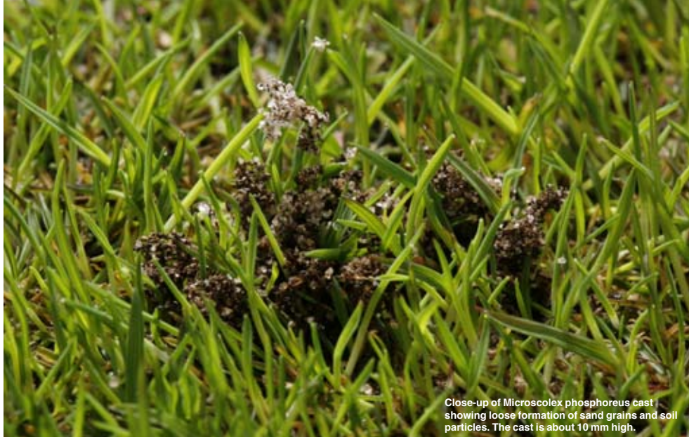
Close-up of Microscoclex phosphoreus cast, showing loose formation of sand grains and soil particles. The cast is about 10 mm high.

Please fill in the short questionnaire and return it with your sample. If you send your email address we will confirm whether or not you have Microscoclex phosphoreus . All the information you send will only be seen and utilized by the Natural History Museum and The Turf Disease Centre, and will be treated as confidential. We will not disclose specific site locations or contact information to third parties. A summary of our findings will be published in this magazine and full results will be published in a soil science journal and made available on the web. In all publications the distribution map of Microscoclex phosphoreus will be plotted at low resolution to ensure precise locations cannot be determined.