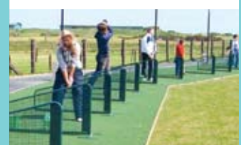
Huxley Practice Tee at St Andrews Links

Huxley Golf PREMIER ALL-WEATHER SURFACES FOR GOLF