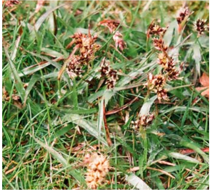
Chestnut brown panicles typical of field woodrush