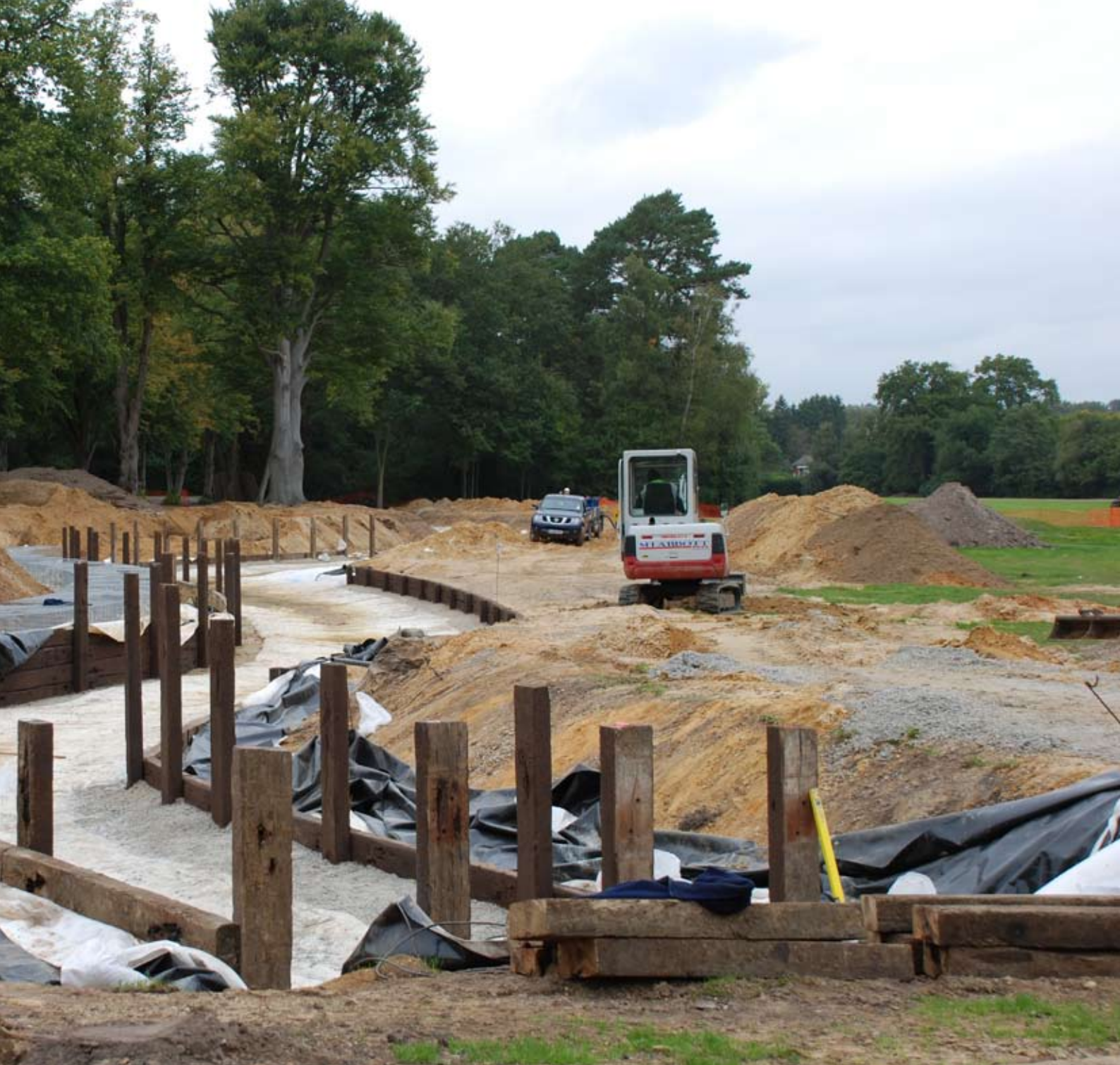
ABOVE: Work is well underway on the amazing new 18th hole with the creek crossing in front of the still-to-be-constructed green

time and our business plan works round playing 12 months of the year and we look at 35,000 rounds per annum.