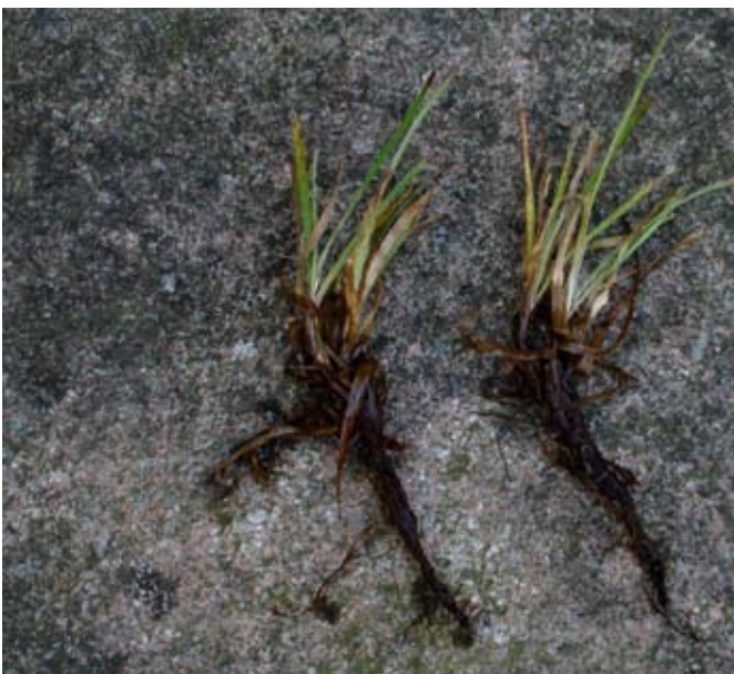
Field woodrush plants showing their tough stolons covered with dead and dying leaf tissue to form a substantial thatch.