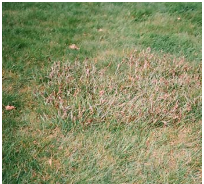
Golfers may suddenly find themselves in what looks like and feels like a mini-rough in the middle of the fairway