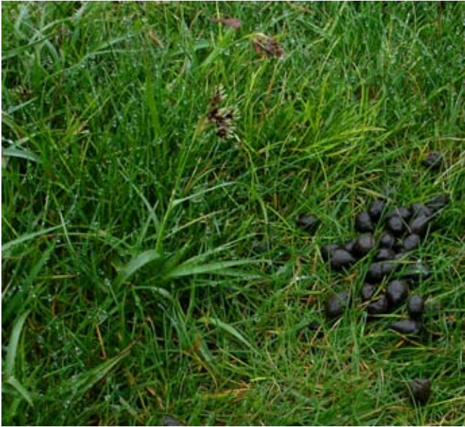
Close up on field woodrush with some usefully placed organic fertilizer (rabbit droppings)