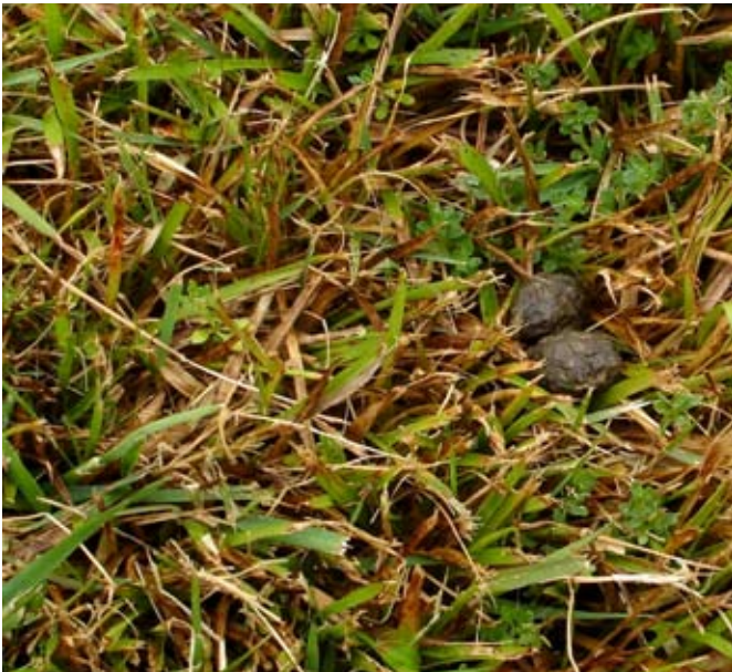
After spring mowing field woodrush retreats into the sward to blend in with coarse true grasses