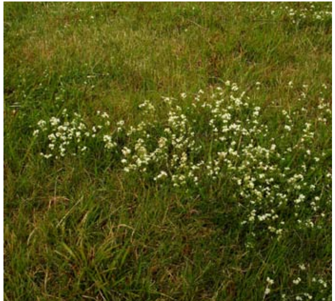
White flowers of heath bedstraw appear alongside field woodrush in June confirming acid nature and low fertility of the soil