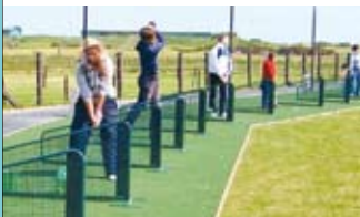
Huxley Practice Tee at St Andrews Links

Huxley Golf PREMIER ALL-WEATHER SURFACES FOR GOLF