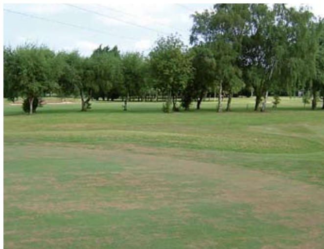
40 Soil Wetting Agents