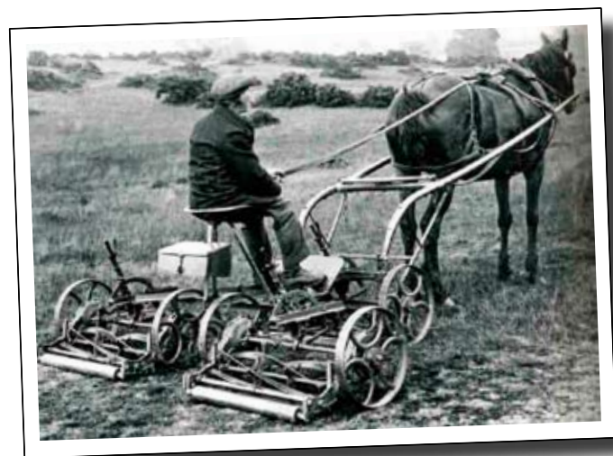
26-27 Sustainability, It's Nothing New!