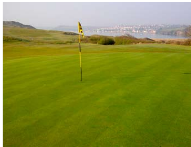
24-25 Why Overseeding Dramatically Improves Course Conditions