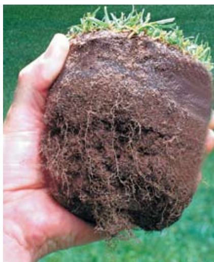
Beneath the surface