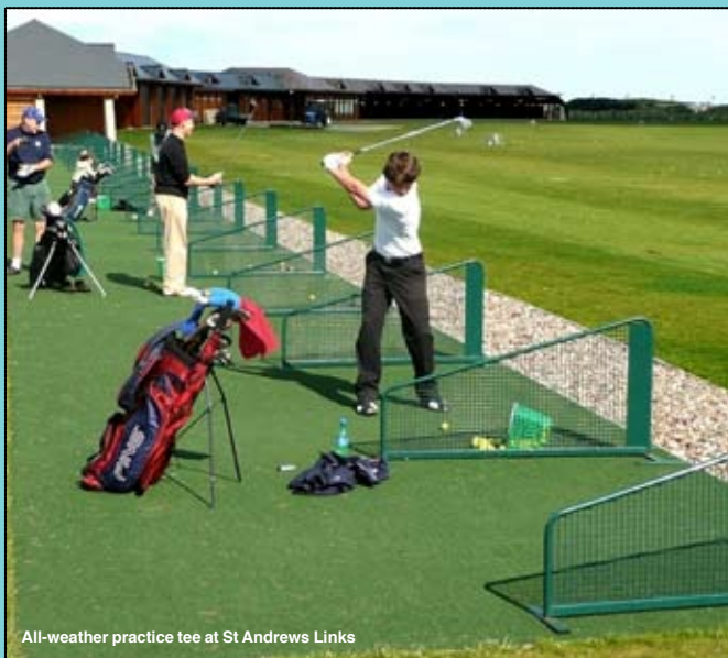
All-weather practice tee at St Andrews Links