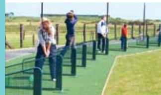
Huxley Practice Tee at St Andrews Links

Huxley Golf PREMIER ALL-WEATHER SURFACES FOR GOLF