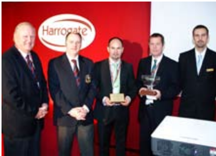
Caldy receive the Golf Environment Competition trophy