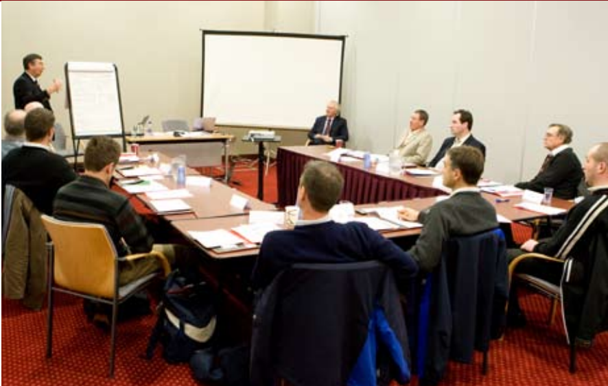
Education, education, education...