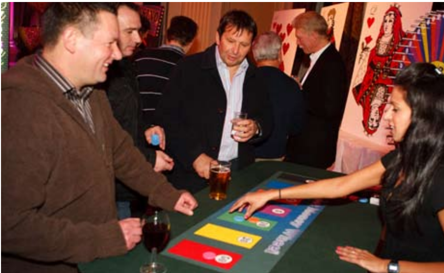
The casino tables proved a hit with the crowds on Tuesday night

Around lunchtime the magazine team and some invited BIGGA members got together for a Magazine Forum to discuss Greenkeeper International and share ideas. It was a well attended, extremely constructive, meeting with over 30 greenkeepers taking time out of their busy schedule and some super ideas emerged. Hopefully you will see these in future issues of the magazine.