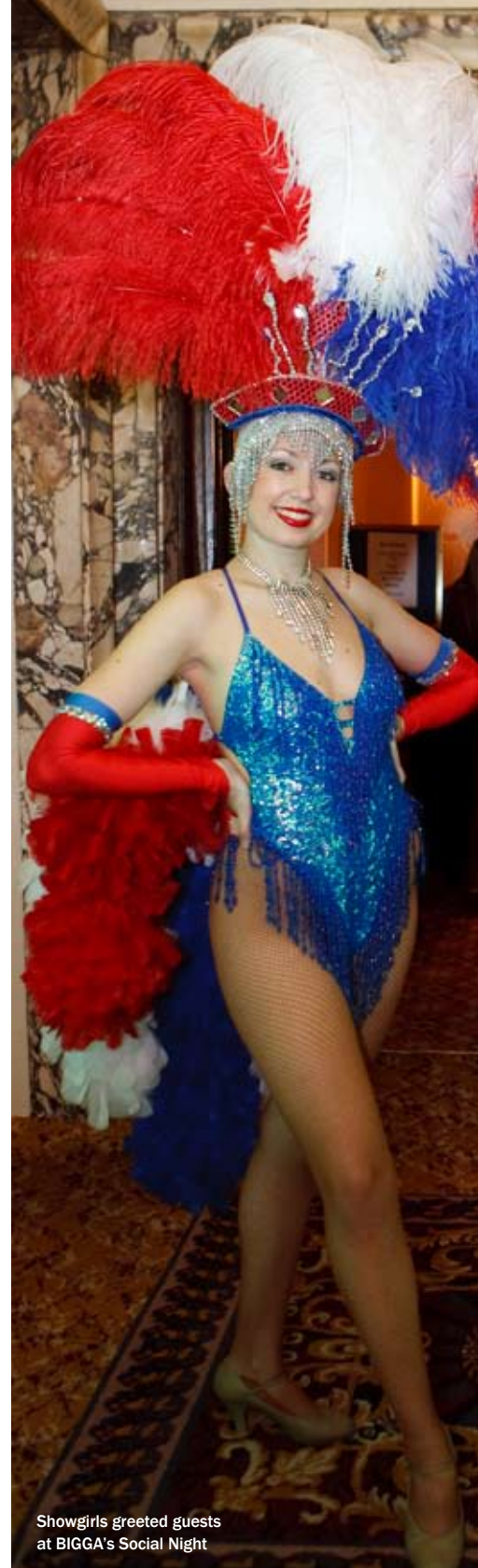
Showgirls greeted guests at BIGGA's Social Night

With excellent food and subsidised beer helping to fuel the evening everyone had a whale of a time and many headed off to continue their night in town.