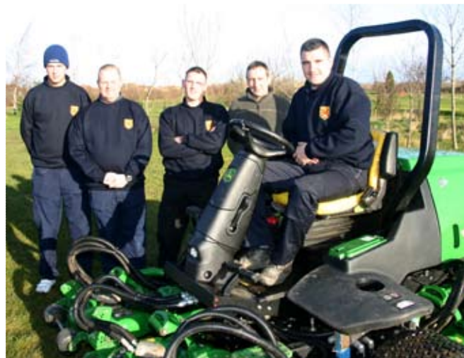
24-25 Quality Control At Heworth Golf Club