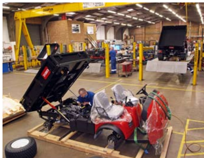
22-23 Golden Key Profile: Toro