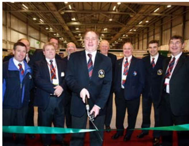
35-42 Harrogate Week 2009: The Review