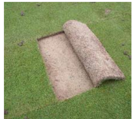
44-46 Off To A Tee: