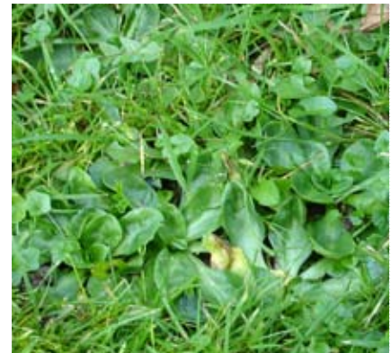
27-29 What Makes A Successful Turf Weed?