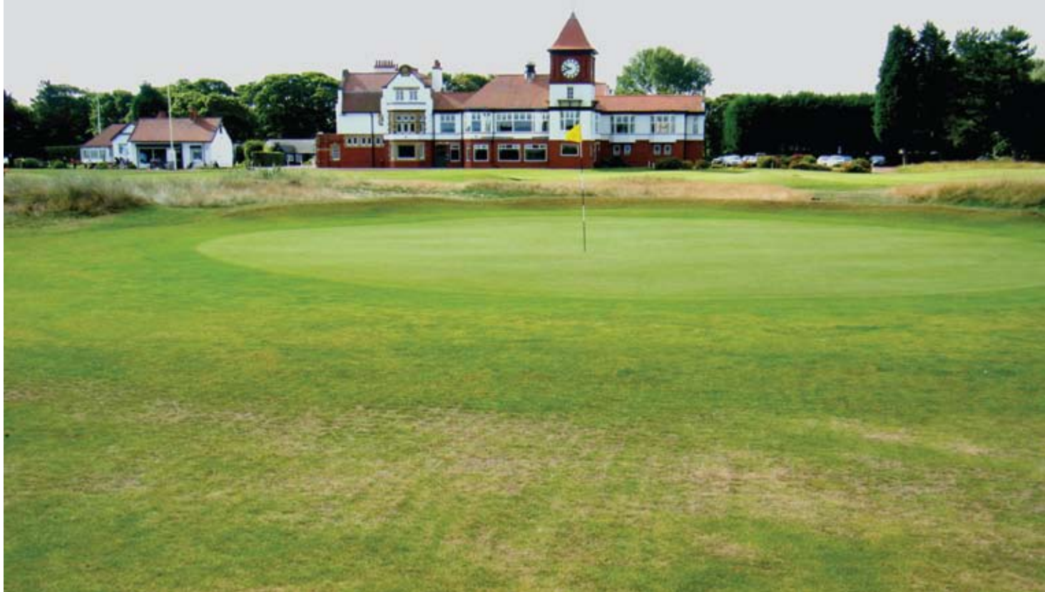
ABOVE: The difference irrigation and wetting agent can make to an apron/immediate approach.

ryegrass contrasting sharply with annual meadow-grass that now contaminates many immediate surround and walk-off areas yet, interestingly, the greens and fairways are invariably ryegrass free.