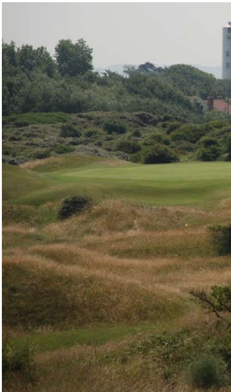
ABOVE: The dune structures at Burnham & Berrow are quite outstanding

percentage of fescue now apparent on many of the greens.