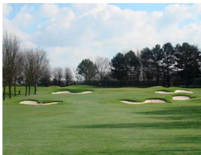
20-22 Designing For Maintenance?