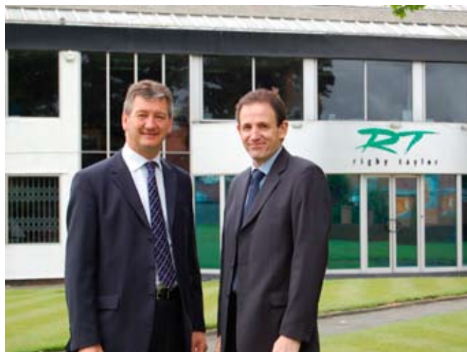
32-33 Rigby Taylor: Golden Key