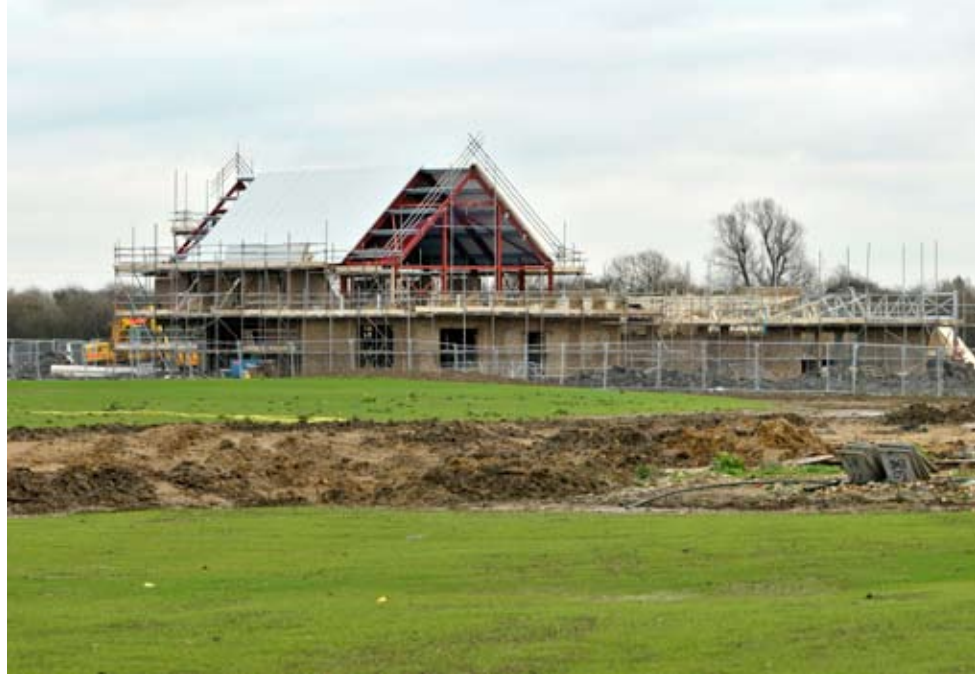
The new clubhouse takes shape

"It is going to be a big step for the club but I think we are starting to put a good team together