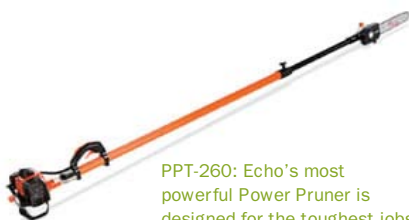
PPT-260: Echo's most powerful Power Pruner is designed for the toughest jobs.