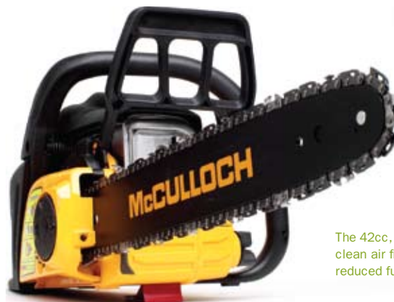
The 42cc, X-Series 8-42 from McCulloch has a super clean air filter system providing longer air filter life, reduced fuel consumption and increased power.

A pole saw or power pruner are useful if there doesn't happen to be a trained chainsaw operator on site as they offer less risk to the operator and the tree.