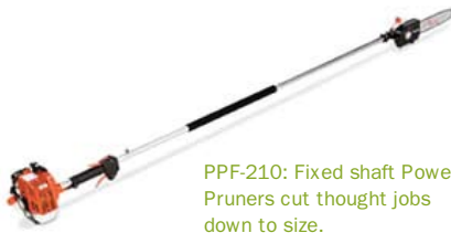
PPF-210: Fixed shaft Power Pruners cut thought jobs down to size.

ECHO Power Pruners® provide fast, easy and safe pruning for hard-to-reach applications. Loaded with features like lightweight design, comfortable controls, adjustable oiler, and Intenz™ guide bars make the Power Pruner a versatile tool that delivers commercial-grade tree care.