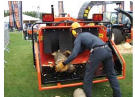
Bear Car 30cm Chipper