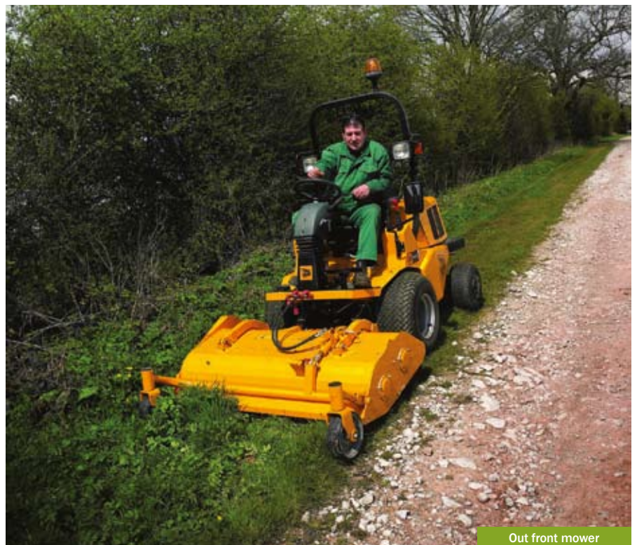
Out front mower