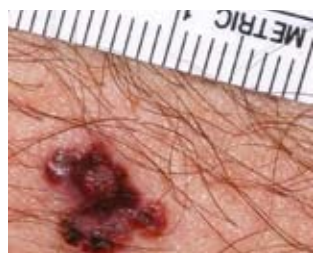
Diameter over 7mm