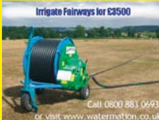
Irrigate Fairways for £3500

Tel: 01772 877289 Fax: 01772 877479 (Preston, Lancs) www.philipdixoncontractor.co.uk