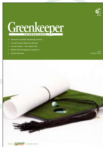
ABOVE: Greenkeeper International magazine LEFT: The BIGGA website