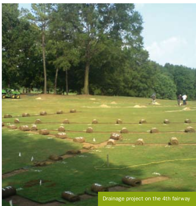
Drainage project on the 4th fairway