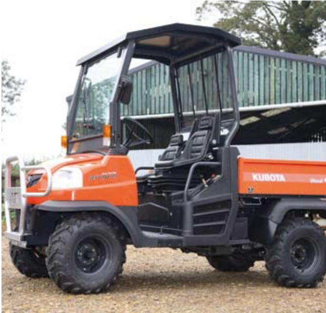
Cushman Turf-Truckster... but a cab can make all the difference to its popularity on a cold morning!