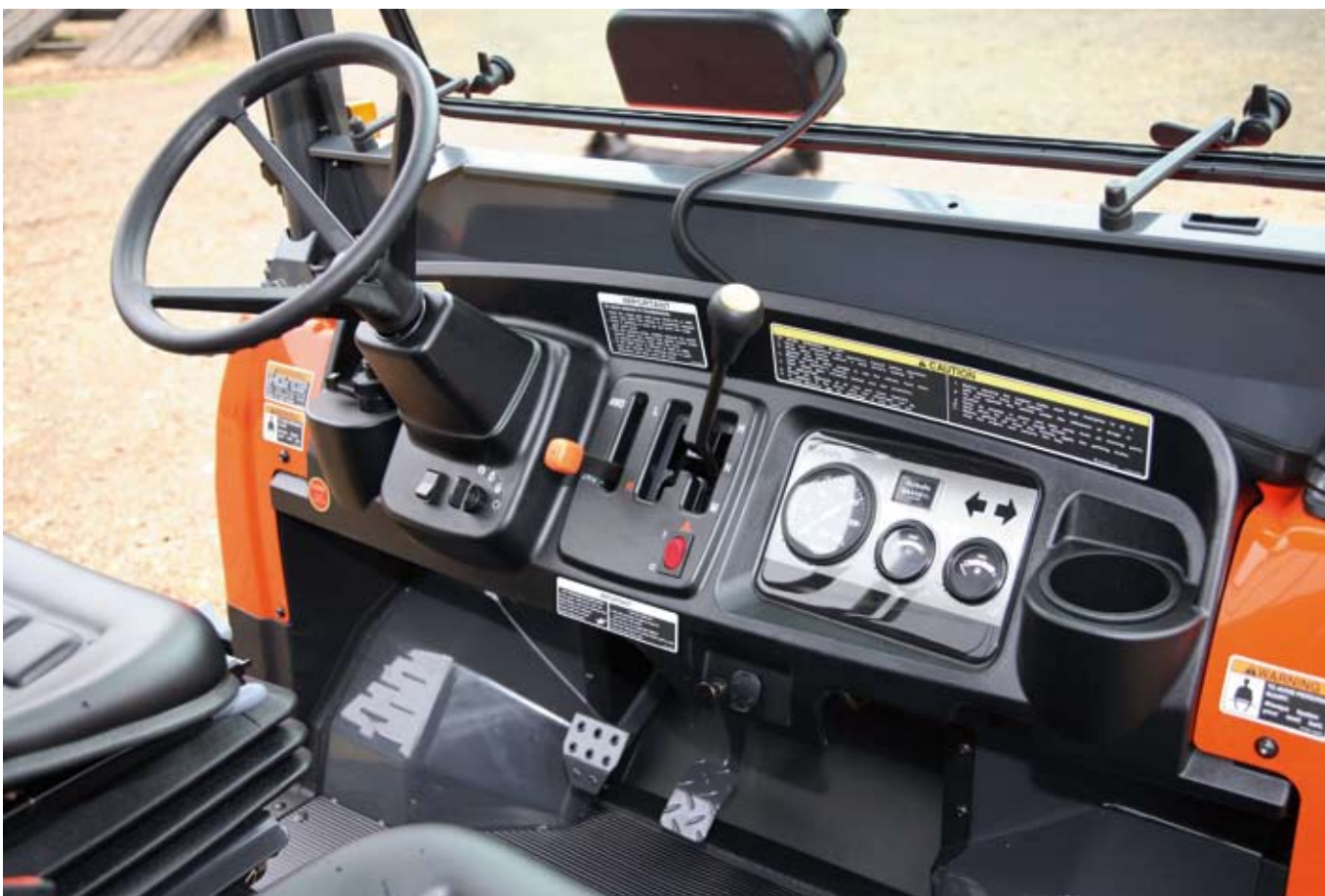
Kubota controls are well thought out and easy to understand, the quality of the fit and finish certainly having more in common with a road vehicle than most utilities. On-road pep not great but on off-road tyres this is no bad thing. Power steering is standard.

For some courses, a road worthy Kubota RTV could well be worth looking at. It is a tough utility with a half tonne load capacity for starters and, with its all-wheel drive and locking differential it can get across pretty tough terrain too. It is well worth looking at.