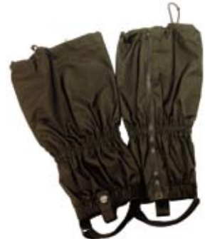
Green King Gaiters: £8.95

Unique and highly specified technical waterproofs, the Green King™ waterproof range is designed for greenkeepers who need to stay dry even in the toughest weather conditions. All Green King waterproof garments are made using state-of-the-art hardwearing Ripstop™ outer shell fabric with fully taped seams for 100% waterproof protection. The range consists of a long coat with built-in hood, overtrousers, leggings and gaiters.