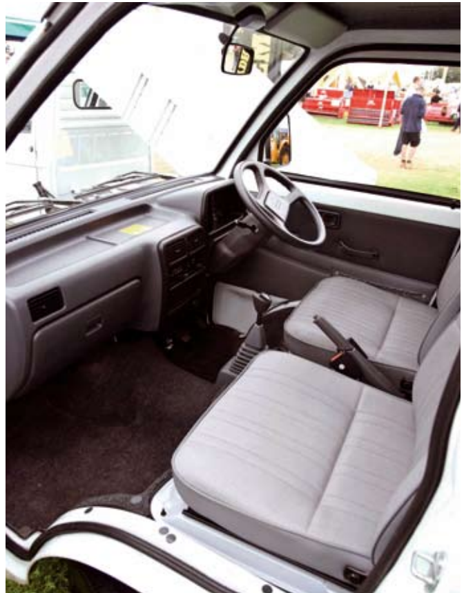
A Piaggio Porter may be spartan by modern pick-up standards, but cosy compared to a utility in the same price bracket. This is a proper 'road going' vehicle, with only 2WD and a five-speed transmission. But with a 1400cc diesel engine it is priced in similar territory to a top end utility.

A more radical approach is to consider a really light pick up such as a Piaggio Porter. These diminutive little Italian vehicles are offered with a choice of not just petrol or diesel power but LPG and electric too. Depending upon the specification, you can expect the payload to be between 560 to 685kg but do not look for much choice in the transmission department; 2WD and a five-speed manual is your lot.