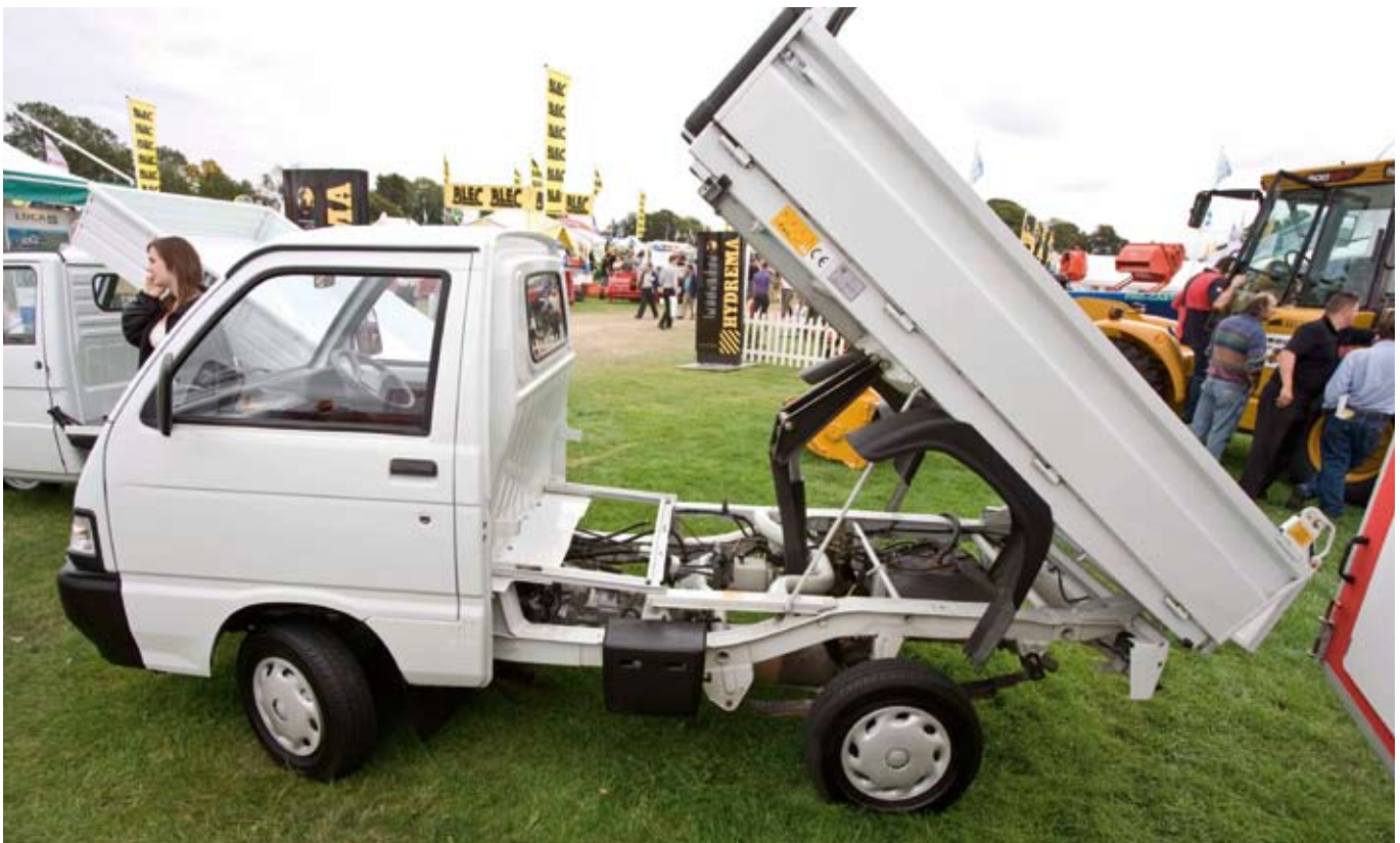
Piaggio has been producing light utility pick-ups and vans for years. Distributor The Pro-Truck Group also offer the three-wheeler Ape range, these little units offering handlebar steering and even lower

Conventional utility vehicle makers will continue to dominate sales, but it can pay to take a sideways glance at an alternative. A little pick-up may well be a very useful addition to the course equipment fleet.