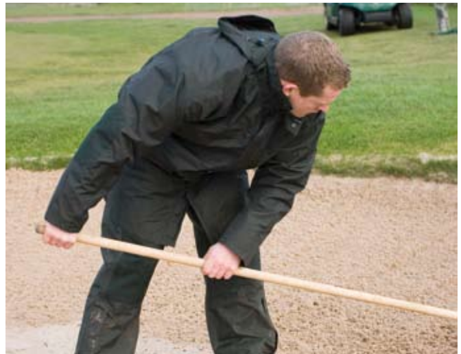
Green King Long Coat: £48.50

For greenkeepers who are not prepared to compromise on quality but have a budget that won't stretch to the top-of-the-range Hogg's of Fife Gore-Tex® waterproofs range, Hogg's - Green King range is the perfect alternative.