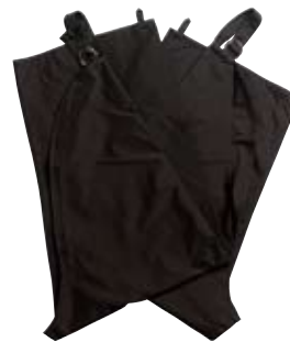
Green King Leggings: £9.95