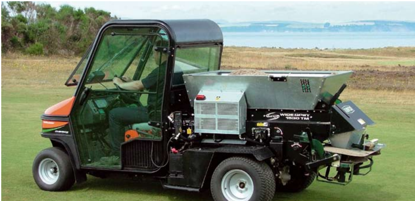
Kubota offers its well-proven RTV900 in road-homologated form. Fitted with a screen and ROPS frame, the unit has individual front seats with suspension for the driver, full road lighting and a front 'crash bar'. Full hypostatic drive means there will be little need to trouble the brake pedal.

So is there some middle ground? Well perhaps, take a Kubota RTV900 as an example, this hydrostatic drive utility can be specified with all the right kit to allow it to be run on the road. Realistically, the option is not designed to make it suitable for long trips on tarmac, but more to allow it to run between sites where there may be more than just a simple road to cross.