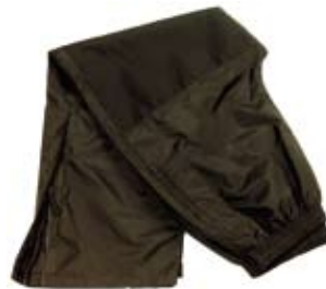
Green King Overtrousers: £20.40