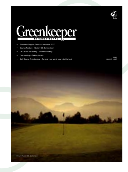
ABOVE: Greenkeeper International magazine LEFT: The BIGGA website

You will find greenkeeping jobs on the BIGGA website for apprentice and assistant greenkeepers.