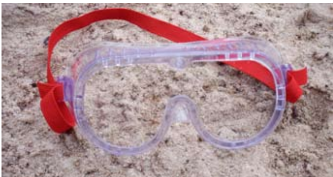
These Safety Goggles (BBGPG) feature a polycarbonate lens and PVC frame. Direct vented and lightweight at only £1.75 there's no excuse for not being safe!