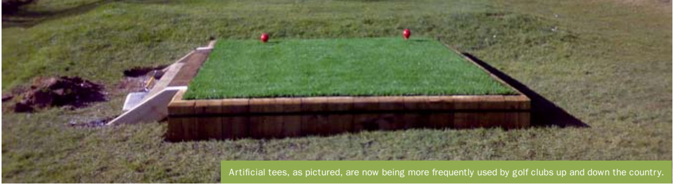
Artificial tees, as pictured, are now being more frequently used by golf clubs up and down the country.