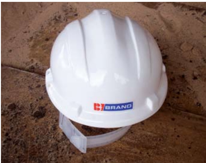
This Safety Helmet (BBESH) features plastic 6 point harness, slip ratchet adjustment and is supplied complete with a sweatband. £2.95