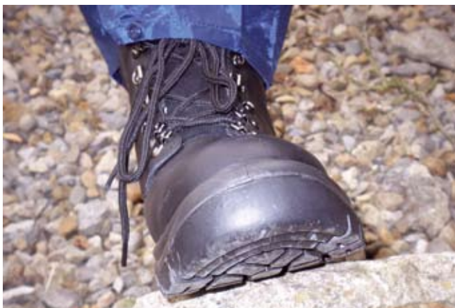
These Hard Wearing Boots feature a 4 'D' ring boot with midsole and a dual density PU anti-static sole. Other features include: 200 joule steel toe cap, shock absorber heel, anti-slip, leather upper, acid and alkali resistant, oil resistant sole and heat resistant to 200 degrees Celsius. £25.50 a pair.

Save time and money by ordering direct from BIGGA. We can now offer quicker delivery times and a better range of products direct from stock at more competitive prices.