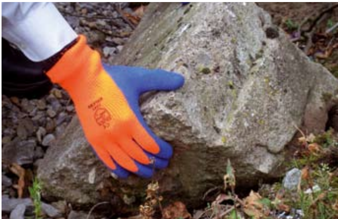
These Thermal Gloves (HVLCSGS) have a heavyweight knitted liner, latex coating and are high visibility fleece lined. Ideal for Winter Conditions. £3.00 a pair

The range will now include Polo Shirts, Fleeces, Safety Footwear, Gloves and High-Visibility garments as well as an improved range of top quality waterproof suits, perfect for keeping you safe and warm.