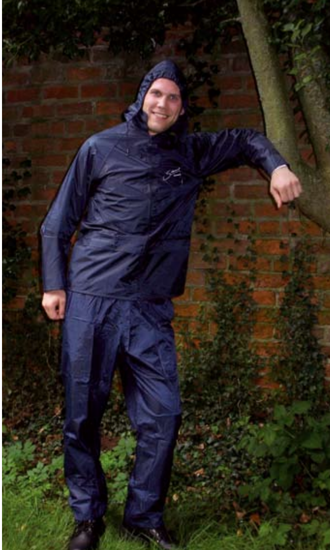
Budget Wet-Suit (NBDS) Lightweight nylon with PVC waterproof coating, the jacket features full zip opening with attached folding hood and two front pockets concealed behind wide flaps. The trousers have an elasticated waist, through access pockets and adjustable stud fastening at the ankle. £5.75 for the set