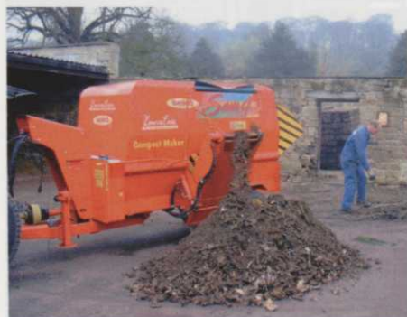
Course Care 5 cubic metre compost maker.

With the introduction of the Hazardous Waste Regulations came the introduction of items not included in the previous regulations (Special Waste Regulations) and those incorporated in the European Waste Catalogue (Hazardous Waste is defined on the basis of this list) and these include, for example; fluorescent tubes, batteries, aerosols, paints, varnishes and solvents, waste oils (including biodegradable and synthetic) and fuels, end of life tyres, CFC's and electronic items. The Waste Electrical and Electronic Equipment Regulations 2006 (WEEE) is due for implementation on July 1 of this year and a number of responsible waste management companies have prepared for this, some already operating collection services. There are 10