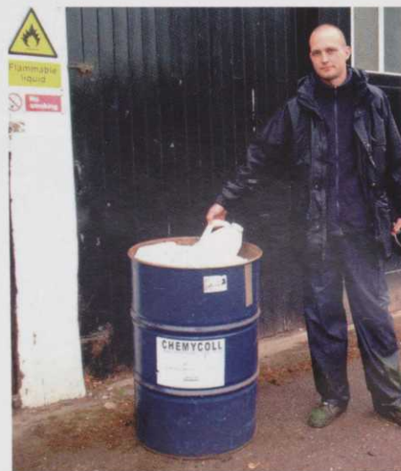
Correct disposal of chemical packaging.

Recycling? Responsible operators will recycle, as does my own company, for example, recycling over 90% of the waste we collect. One example is the many thousands of plastic containers that are processed in a huge machine that chops the product into small plastic chips that then go on