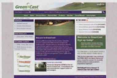
GreenCast – our unique turf management decision support system.

A powerful new internet-based decision support service specifically developed for the UK and Ireland is now available to turf managers through Syngenta. Called GreenCast, it gives turf managers early warnings of likely disease attacks and weather events via a dedicated website, www.greencast.co.uk