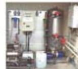
The ENZYMATIG15 wash water recycler. Designed & built in the UK by ByWater

Tel: 01530 833469 Fax: 01530 810795 Email: sales@bywaterservices.co.uk Web: www.bywaterservices.co.uk