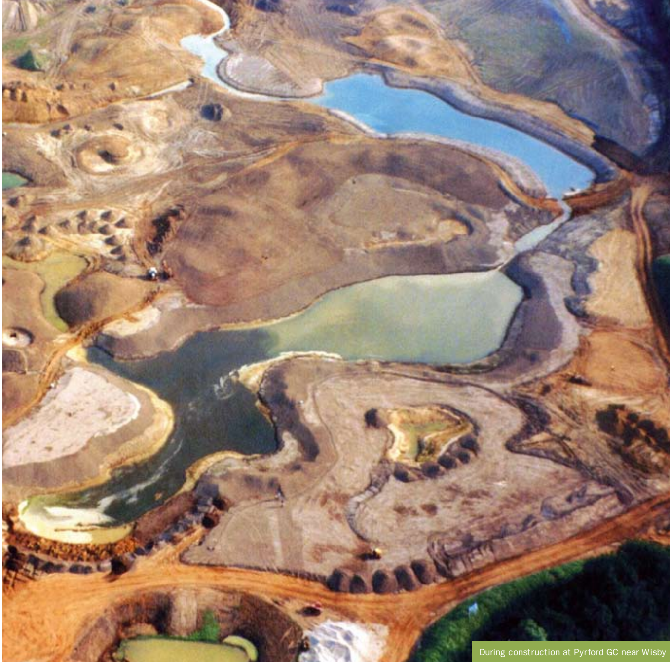
During construction at Pырford GC near Wisby

Water proofing water features can be costly if a complete liner is required. However, if there is clay in the subsoil this can be used to help waterproof to above the top water level. Bentonite, which is an inert 'fullers earth' can be used to waterproof the base of the lake, depending on the type of soil.