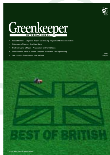
ABOVE: Greenkeeper International magazine LEFT: The BIGGA website