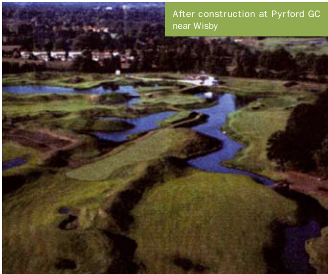
After construction at Pырford GC near Wisby

Although a golfer is concentrating on his game, to be in the natural countryside with views of a magnificent lake, surrounded by wonderful fauna and flora can only add to their pleasure. With the need for a 'greener world' and golf courses becoming more 'family orientated', the enhancement of the environment is even more important. Waterplants can also add beauty to a water feature. The depth of water is important with shallow water for the waterplants and deeper water, at least three meters, if stocking trout. The waterplants, especially phragmites can help a great deal in the balance of a pond by restricting the blanket