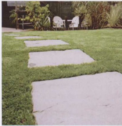
A garden recently transformed from natural to artificial grass

Technical Surfaces, who have over 25 years experience within the synthetic surfaces industry have launched a brand new product called 'SowGreen' to the leisure market. It uses not just one colour but a blend of tones to replicate the natural look of grass and once laid gives a swirling effect associated with natural turf.