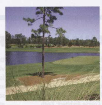
18 The Pinehurst Reso

Your next issue of Greenkeeper International will be with you by February 14 2007.