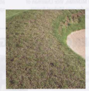
Do you need to consider changing your grass species?