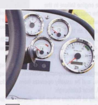
33 Ergonomically advanced