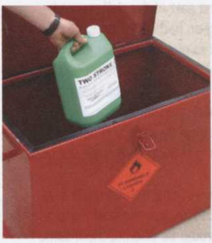
The storage and carriage of petrol is a concern for us all