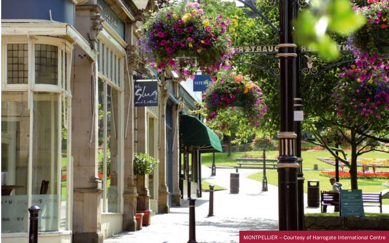
MONTPELLIER – Courtesy of Harrogate International Centre