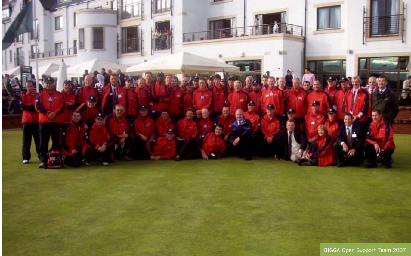
BIGGA Open Support Team 2007