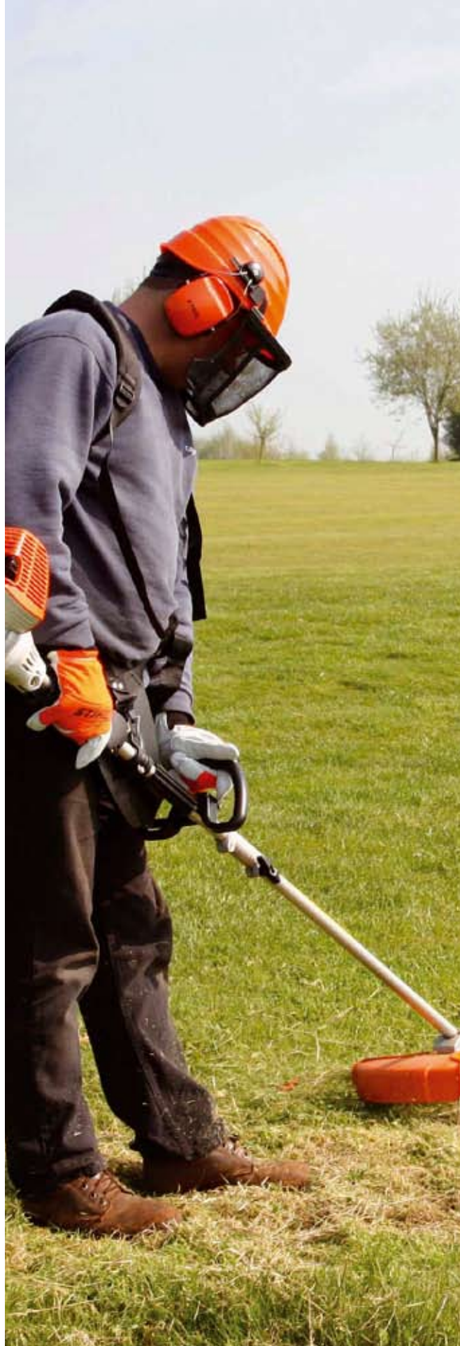
Stihl offers its 4-Mix power unit on brushcutters with power outputs from 1.3 to 1.9hp, with prices starting at around £320 for its entry level FS 87 and topping out with the FS 310 at £550. The pictured KM 100 R power unit is part of the Stihl CombiEngine line-up. It can be used to power brushcutter, hedge trimmer and brush attachments. Prices from £300 plus attachment

There is no 'physical' abrasion with these systems either, so the carburettor is not subjected to any wear that can enlarge any of the apertures. In most cases, a carb cleaned by this type of system will perform 'as new' on replacement. Where it does not, a new unit will typically need to be fitted. Apart from fitting new diaphragms, repairing a faulty carb is increasingly no longer viable or possible.