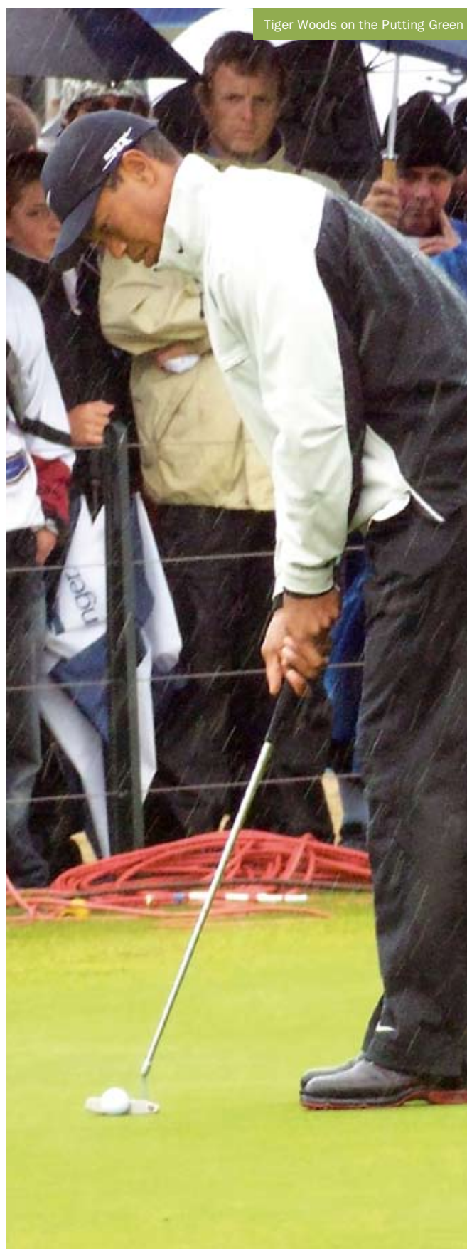
Tiger Woods on the Putting Green