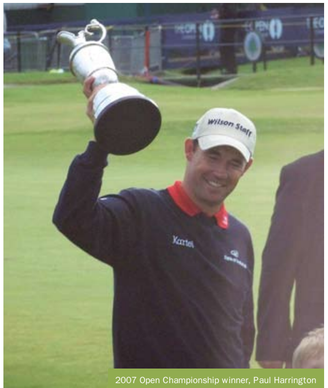
2007 Open Championship winner, Paul Harrington