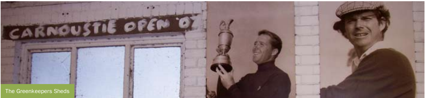
The Greenkeepers Sheds