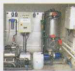
The ENZYMATIC15 wash water recycler. Designed & built in the UK by ByWater

Tel: 01530 833469 Fax: 01530 810795 Email: sales@bywaterservices.co.uk Web: www.bywaterservices.co.uk