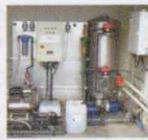
The ENZYMATIC15 wash water recycler. Designed & built in the UK by ByWater

Tel: 01530 833469 Fax: 01530 810795 Email: sales@bywaterservices.co.uk Web: www.bywaterservices.co.uk