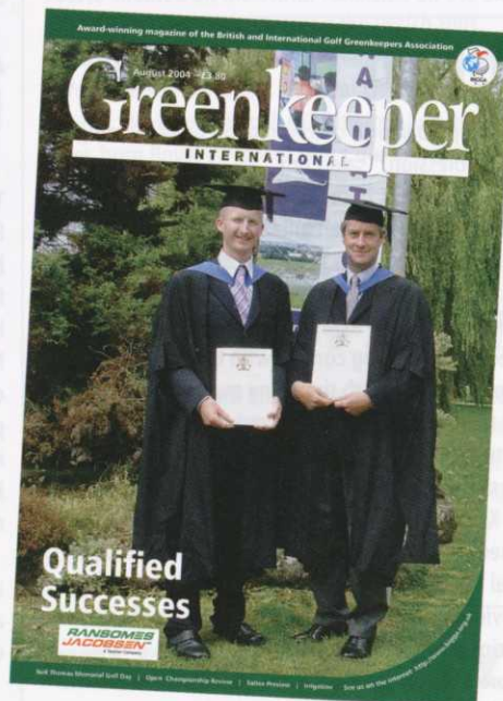
This could be You!

All this can be achieved without giving up your job and several GTC Providers will be willing to discuss the various study options to achieve your goal.