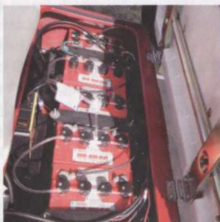
23 Electric power