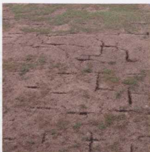
16 Golf courses around the country suffered from drought this Summer

Your next issue of Greenkeeper International will be with you by November 7 2006.