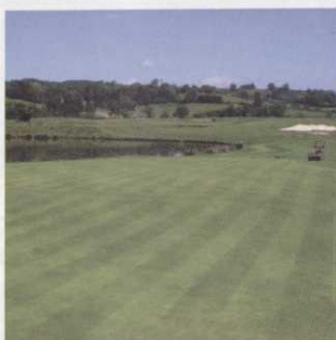
39 Dramatic changes have taken place within the turf industry in the last decade