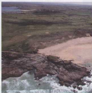
18 One of the things Cornwall isn't necessarily associated with is golf