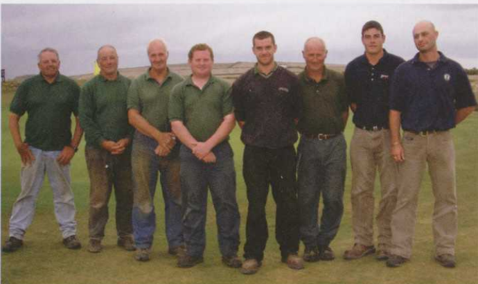
The Trevoze greenkeeping team

"We will be building more tees, levelling and extending others, continuing bunker renovation, extensive fairway programs while the roughs natural marran grasses are being transplanted and promoted throughout the course."