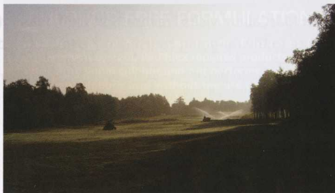
Hollow Tining and Irrigation