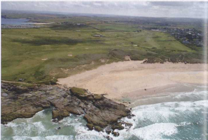
Trevoze golf course and Constantine Bay

They discovered that the bunkers that were built to trap the original second shots are there for the tee shots, now thus meaning that they haven't had to make as many major alterations as might have been the case.