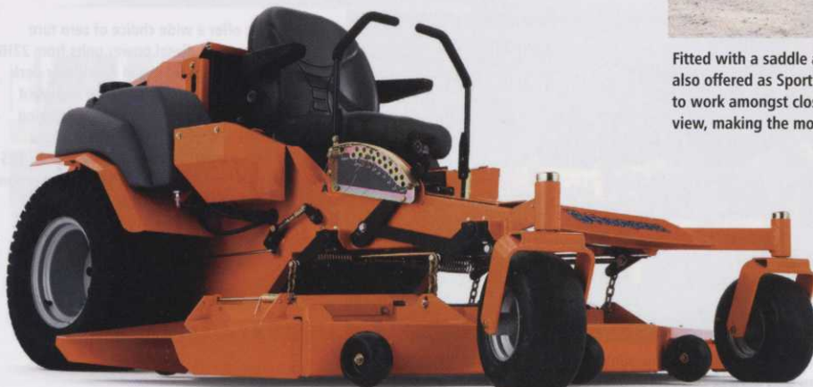
Husqvarna offers both petrol and diesel powered zero turn mowers, the 27hp BZ27D sharing the same compact dimensions with other models in the range. Fitted with a 61 inch / 1.55m deck, its larger 34hp brother, the BZ34D will suit those looking for greater output with its 72inch / 1.83m mowing width