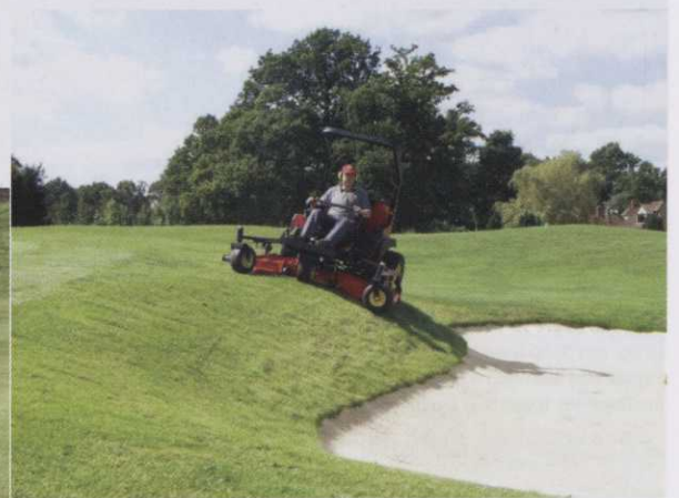
Lastec offer a wide choice of zero turn models, with diesel power units from 22HP to 36HP. The established Articulator deck design allows close following awkward contours as pictured, the mowers being offered with deck choices that include working widths from 39 inch / 1.0m to 195 inch / 5.0m with three or four deck sections according to model. Options include stripping roller kits and collectors