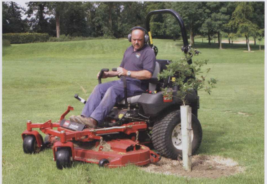
It does not take long to master the controls of a mower like the Toro Z590-D, a close cut around trees helping to reduce the amount of work that may previously have been carried out with a brushcutter. When trying a machine, try it with a collector. These can be useful when dealing with leaves in autumn

Slightly larger petrol powered machines, with power units of about 25hp and decks of around 60 inch / 1.52m form the next 'group'. Physically larger than entry level models, these units offer good performance and productivity and can be well priced at around £8,000.