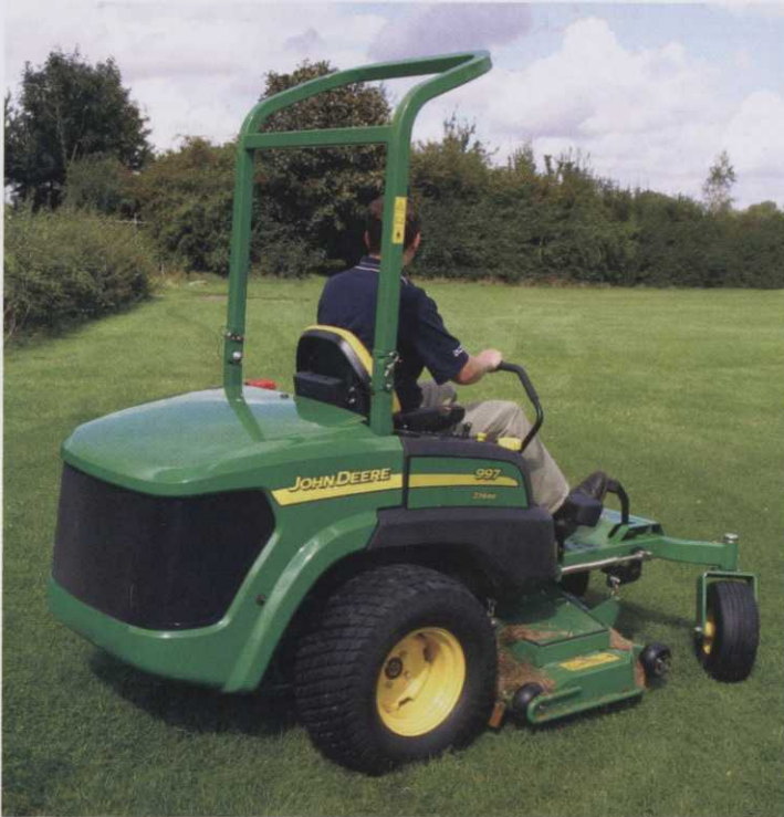
The John Deere JD 717E and JD 997 (pictured) zero-turn mowers are powered by 19hp petrol and 30hp diesel engines respectively, the larger model being designed and built in Europe and featuring a choice of side-or rear-discharge decks. Both models are fitted with folding ROPS frame and lap belt as standard

It is also important to check on the warranty offered. A one year warranty is the norm, but some manufactures offer second year cover as standard. Check the conditions of the warranty are made clear too. It does vary between suppliers.