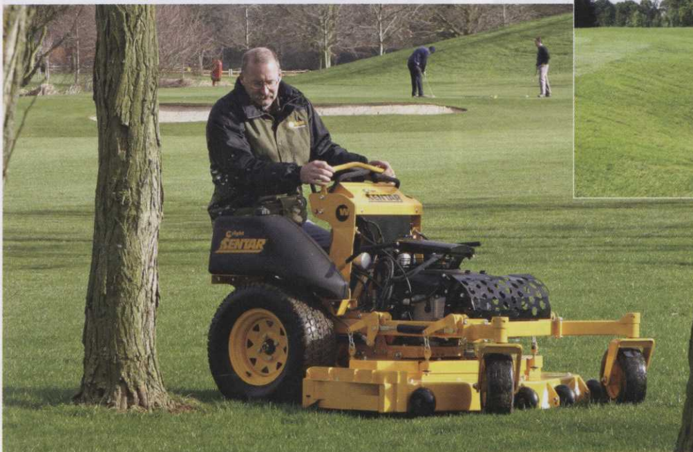
With a choice of 52 inch / 1.32m or 61 inch / 1.55m deck, the Wright Sentar can tackle reasonably large areas without any compromise on its ability to mow close to trees. As with any zero turn mower, clean turns can be achieved after only a little practice