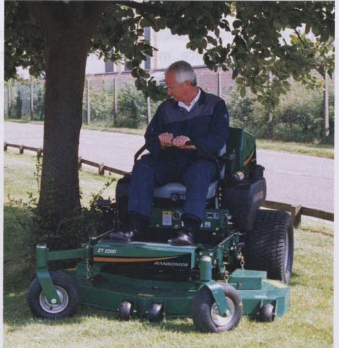
Powered by a 20hp diesel and fitted with a 60inch / 1.50m deck, the Ransomes ZT220D is claimed to have the capacity to mow up to 3.5 acres / 1.4ha in an hour. Although this will be in ideal area mowing it does serve to illustrate the serious capacity offered by zero turn mowers