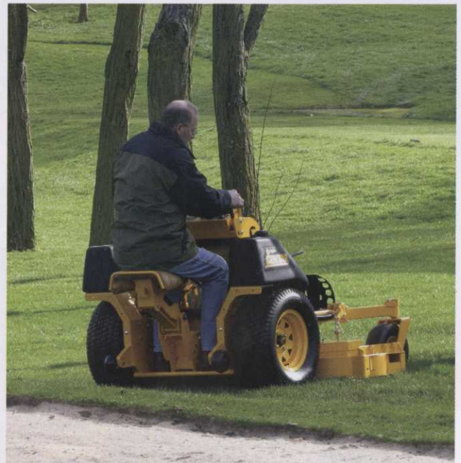
Fitted with a saddle as opposed to a seat, the 25hp petrol engine Wright Sentar is also offered as Sport version with a diminutive 36 inch / 0.90m deck. This allows it to work amongst closely spaced trees. The operator can stand up to get a better view, making the mower great in a tight space