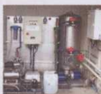
The ENZYMATIC15 wash water recycler. Designed & built in the UK by ByWater

Tel: 01530 833469 Fax: 01530 810795 Email: sales@bywaterservices.co.uk Web: www.bywaterservices.co.uk