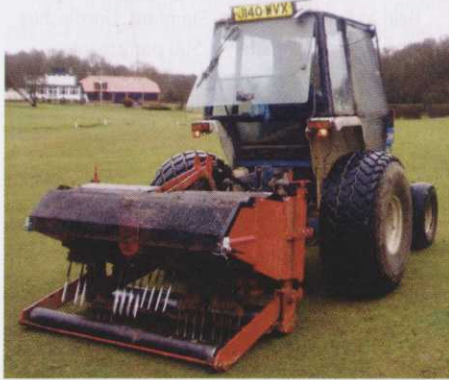
One hopeful entrant is Theydon Bois Golf Club. The Essex course bought its machine back in 1990.

Turf managers simply have to provide the serial number on their Verti-Drain, together with a photograph and a brief history of the machine. Once the oldest working model is established, its owner will receive a modern version.