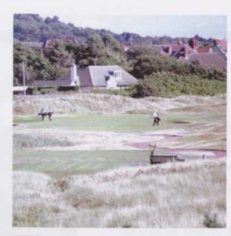
18 Preparing for the Open

Your next issue of Greenkeeper International will be with you by August 7 2006.