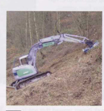
Difficult area dealt with