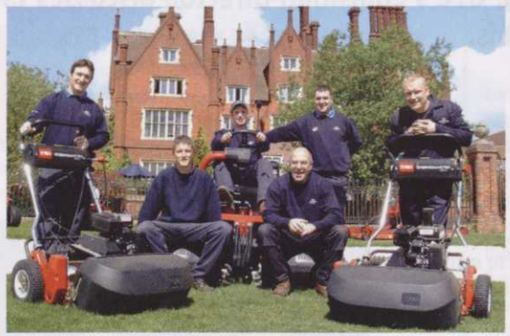
The Dunston Hall golf course team with some of their new equipment

More than £130,000 has been spent buying additional equipment to redeveloping areas of the golf course to increase standards. "Dunston Hall is a busy course with a flourishing membership. It is also a very popular golf destination. But we are keen to attract top amateur and local pro-am competitions," added Kevin, "so have embarked on a five year investment programme to enhance the presentation and improve the playing surfaces."