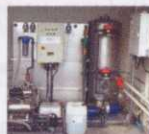
The ENZYMATIC15 wash water recycler. Designed & built in the UK by ByWater

Tel: 01530 833469 Fax: 01530 810795 Email: sales@bywaterservices.co.uk Web: www.bywaterservices.co.uk