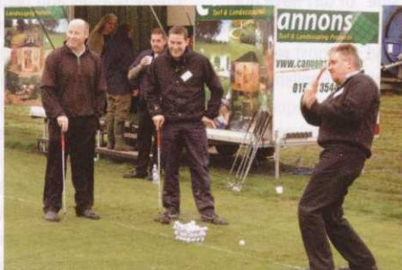
A Nearest the Pin competition was held during the Open Day

Cannons Turf hosted a Trade Open Day in Lincolnshire on October 25, inviting visitors, many from the golf sector, for a tour of the turf, irrigation facilities and to view the Trilo 110 BV turf harvester.