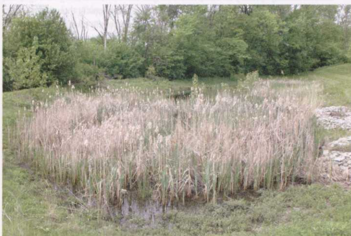
Filter on wetland

As a PhD student at Michigan State University, I have had the privilege of seeing first-hand some of the strategies that are being implemented in the United States by golf courses in the fight to ensure that they protect the environment by reducing mains and well-water usage. I have visited many courses in the state of Michigan with my supervisor at Michigan State