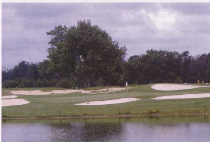
Lake on golf green