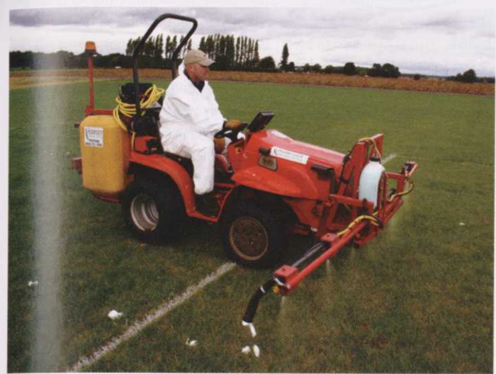
McCormick G Series compact tractor, used by Amenity Contract Services for sports and amenity turf spraying

Typical operating speed is 7-8kph, so the 300-litre tank has enough capacity for the spraying outfit to cover alot of ground with each fill.