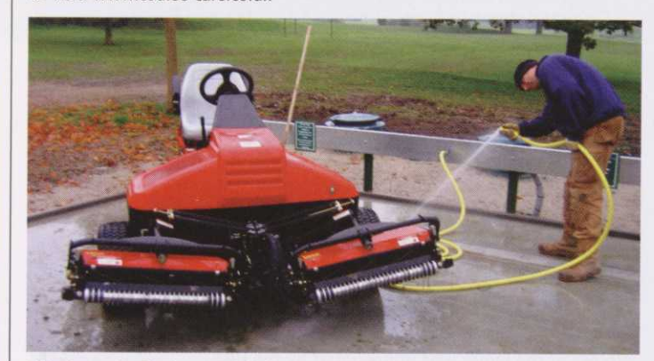
Effective wash-off using a typical ClearWater installation

For more information call Course Care on: 0845 600 3572 or visit: www.course-care.co.uk