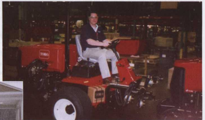
The 300,00sq ft Toro Factory, Tomah

This whole experience will stay with me for many years. I feel honoured to have had this unique experience and wish good luck to all the nominees for the 2005 Competition.