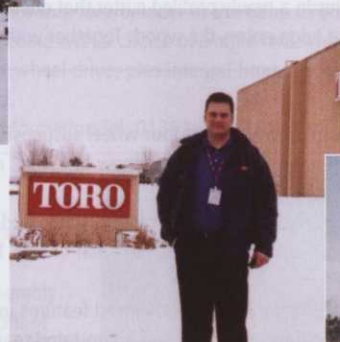
After completing the turf course it was off to visit Toro HQ in Minneapolis