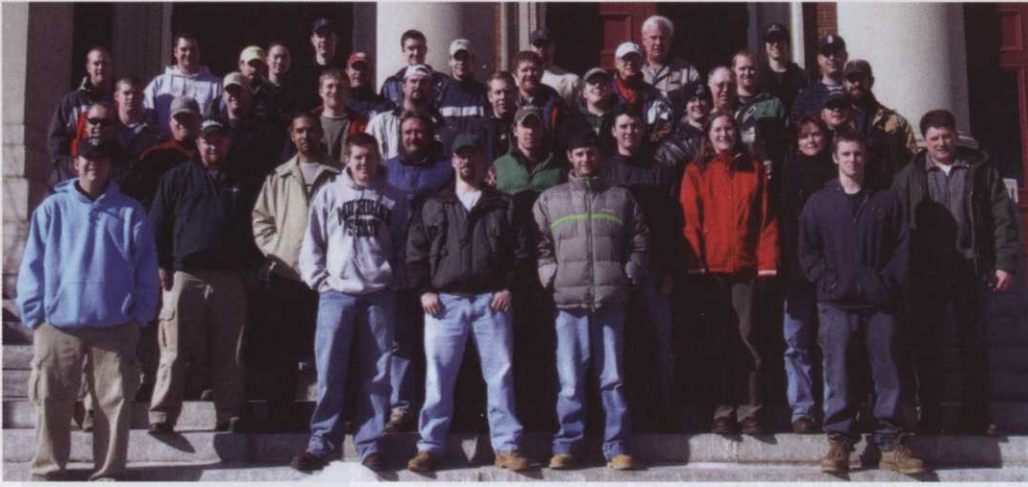
Class of 2005