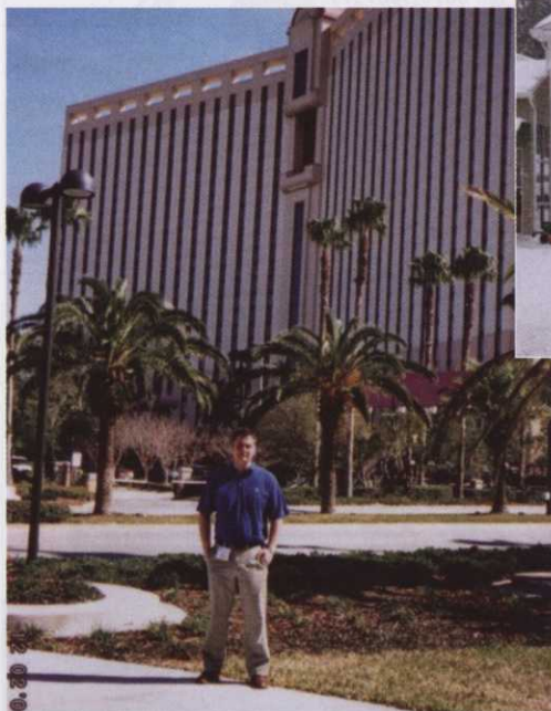
Florida - GCSAA Exhibition