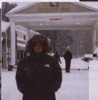
Wrapping up warm was a must in Massachusetts