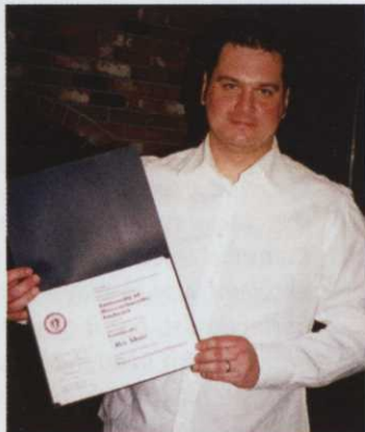
A satisfying reward after all that hard work

The next day, with little time to settle in, I had to catch the 6.30am bus to the University of Massachusetts for my first day of study. It was very strange, new people, getting use to the American way of studying and dealing with the time difference. We were given a quick introduction to the 74th annual winter turf school and straight into lectures.